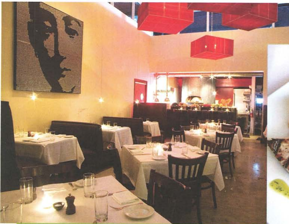
The crisp linear interior of the dining room, accented by a striking wall mosaic made of Guatemalan coins, is just simple enough to allow the cuisine to take center stage. The local grilled Cobia served with couscous is the perfect antidote for any fresh summer craving.